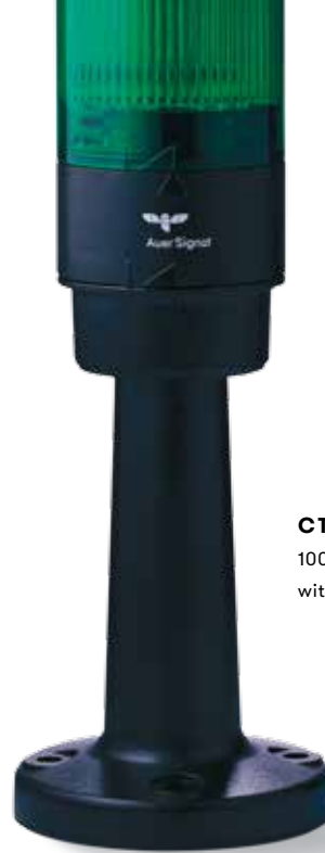
CT5KR1 100-mm-long tube base with integrated foot

The tube base with a new, one-piece 100-mm-long plastic tube with an integrated plastic foot is the cost-effective standard tube assembly of the CT5. The tube lengths 250 and 400 mm are available with an aluminium tube and plastic foot, as with other signal towers.