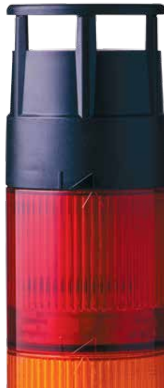
CT5ZM Top Piezo Summer module