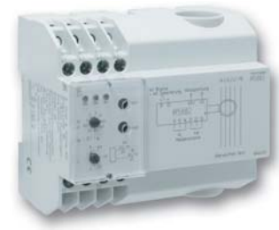
Residual current monitor IR 5882