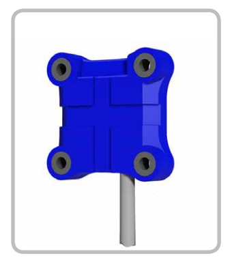
Measurement through non-metallic container walls