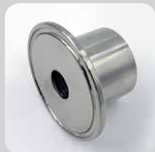
Art.-Nr. 190757 Tri-Clamp