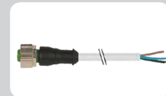
Art.-Nr. 193392 Connector 4 x 0,34, 5 m