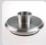
Art.-Nr. 196395 Varivent N DN 50