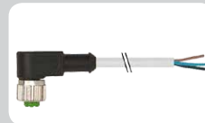
Art.-Nr. 193391 Connector 4 x 0,34, 5 m