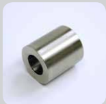
Art.-Nr. 196394 Welding socket

When the sensor is mounted with our adapters: welding socket or the process adapter Varivent N DN 50 a hygienic, EHEDG conforming process connection will be achieved.