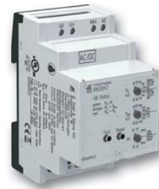
Insulation monitor RN 5897/300