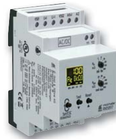
Insulation monitor RN 5897