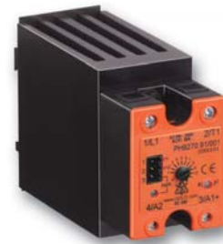
Solid state contactor PH 9270